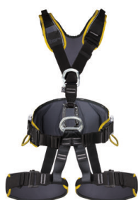
EXPERT 3D STANDARD