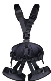
EXPERT 3D STANDARD black