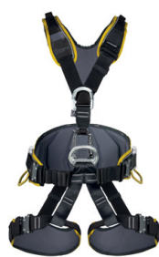
EXPERT 3D SPEED