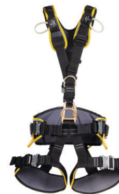
EXPERT 3D SPEED STEEL