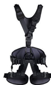
EXPERT 3D SPEED black